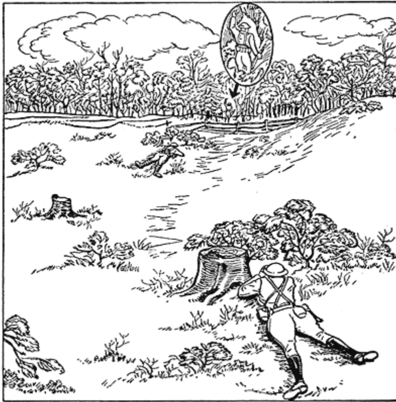
Plate 21. Approaching a Wood.

Reconnaissance of woods. The near edges of woods should always be approached with caution, the platoon being halted if necessary. The scouts reconnoiter in pairs, one man entering the woods, the other remaining at the edge to maintain contact with the platoon. The scout who enters proceeds to the limit of visibility. If no sign of the enemy is discovered, he signals "Forward," which signal is transmitted to the platoon by the scout remaining at the edge of the woods. The scouts remain as they are until the advanced elements of the platoon reach the edge of the woods. In passing through the woods, distances and intervals are reduced so that adjacent pairs of scouts can see each other and the platoon runners in rear.