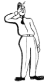
Clem's First Idea of a Good Salute