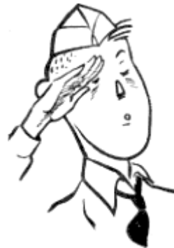
This will work, sometimes. NOT RECOMMENDED