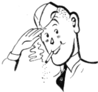
Our Hero Salutes with a Cigarette in his Mouth